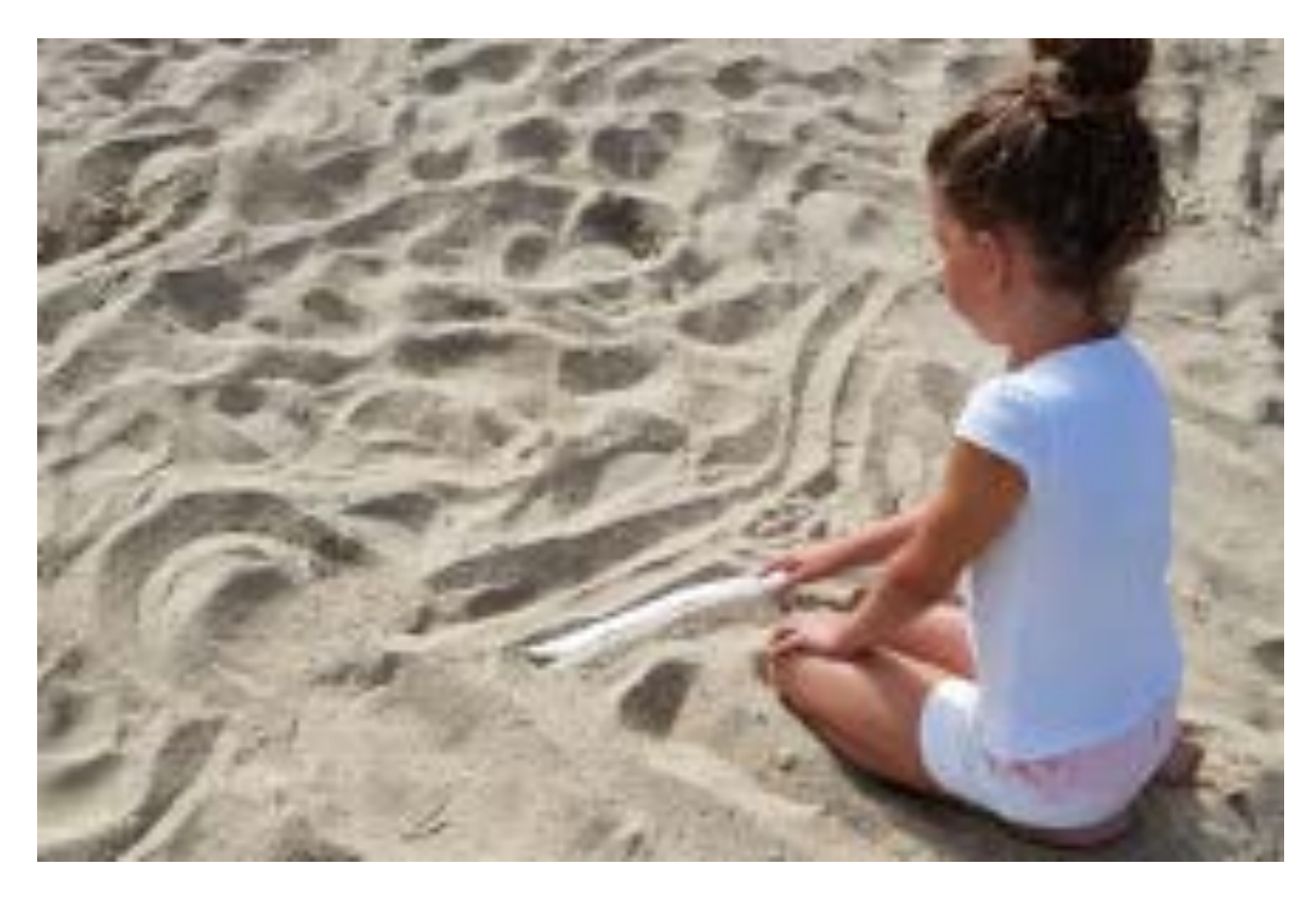
Fig. 9- Working with the scale. Workshop: "A Vila do Mañá, Bueu".

We present the concept of human scale relating it to the urban scale. From becoming aware of the dimensions of our own body, we can address other dimensions, such as the city and the territory. It is a perceptual route that we place between the hand, which represents the near, and the horizon, the most distant captured by our senses.