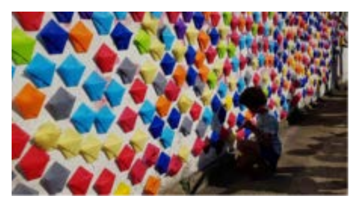
Fig..3- Transforming the city. Workshop: "A Vila do Mañá, Ferrol".