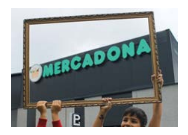
Fig. 2- What would you frame in your city? Workshop: "A Vila do Mañá, Milladoiro".