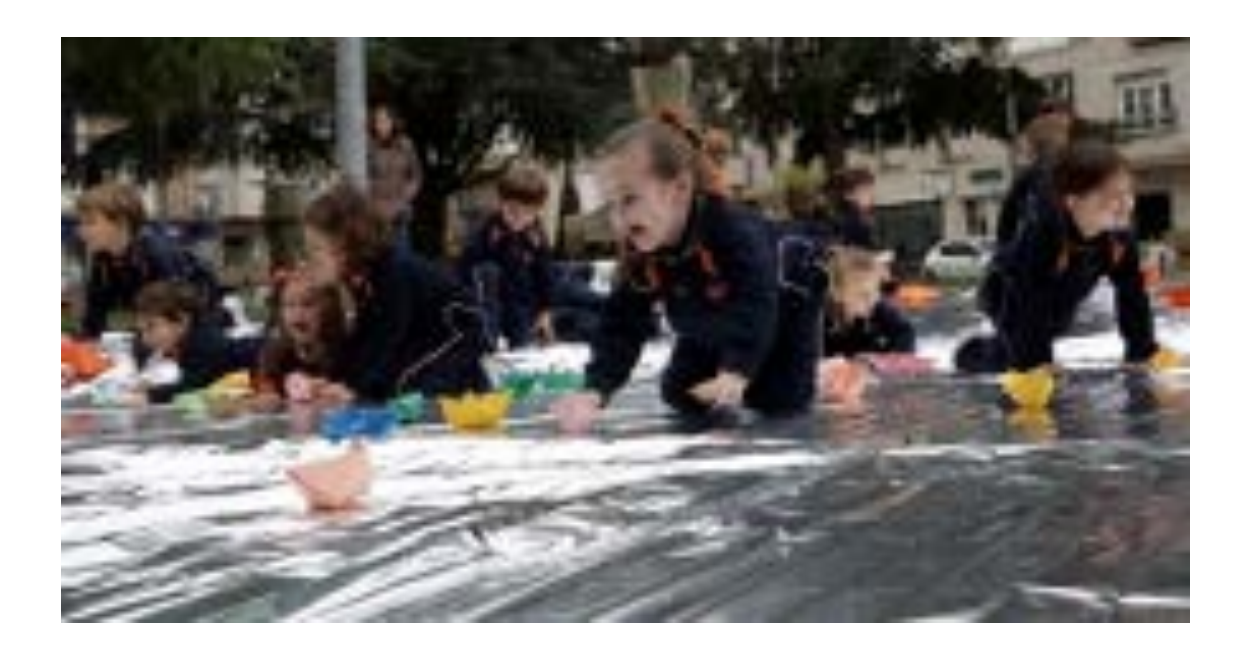
Fig. 6-Transforming the perception of the city. Workshop: "A Vila do Mañá, Vilagarcía de Arousa"