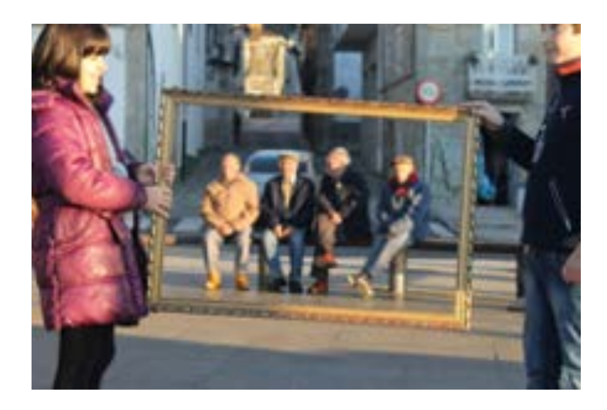
Fig. 4- What would you frame in your city? Workshop: "A Vila do Mañá, Rianxo".

Our strategy tries to reverse this situation, appropriating these places to make them common again, establishing vital links with them through experiences and interventions.