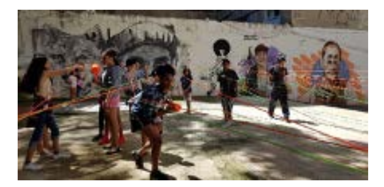
Fig. 12-Transforming the city with the plane. Workshop: "A Vila do Mañá, Sao Paulo".