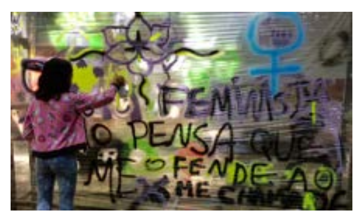
Fig. 8- Playing with perception. Workshop: "A Vila do Mañá, São Paulo".