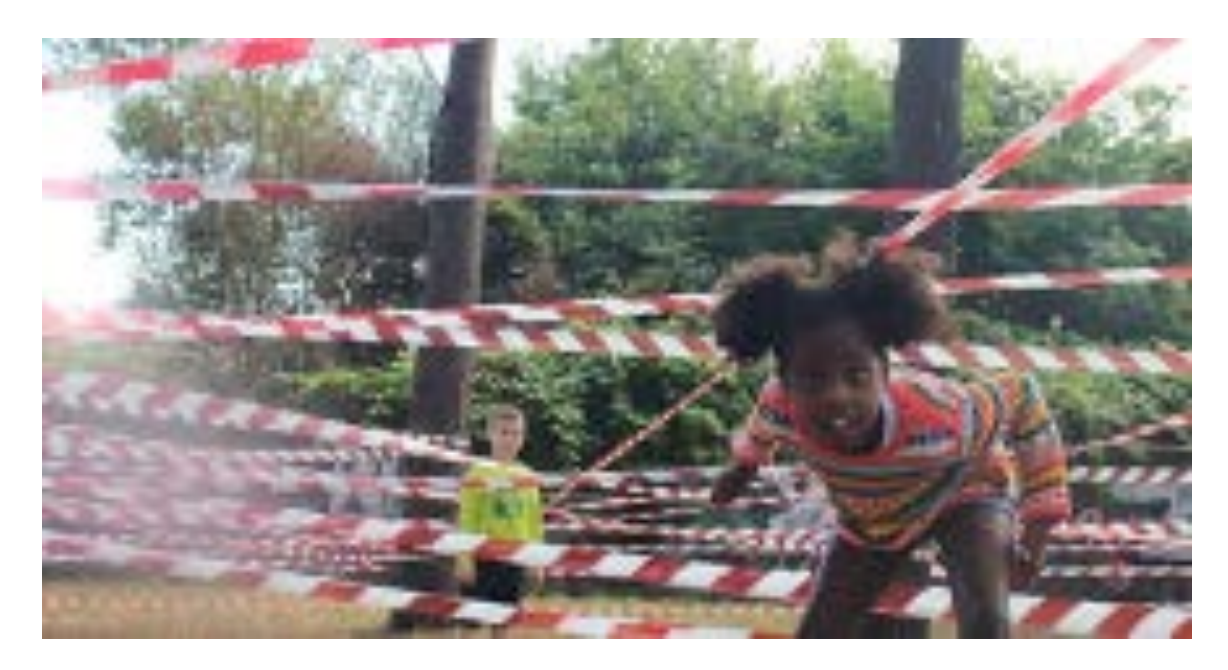
Fig. I I - Transforming the city with the line. Workshop: "A Vila do Mañá, Milladoiro".