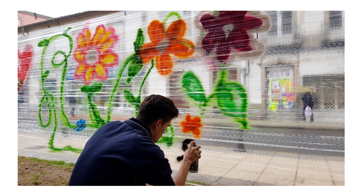
Fig. 7- Playing with perception. Workshop: "A Vila do Mañá, Vilagarcía de Arousa".