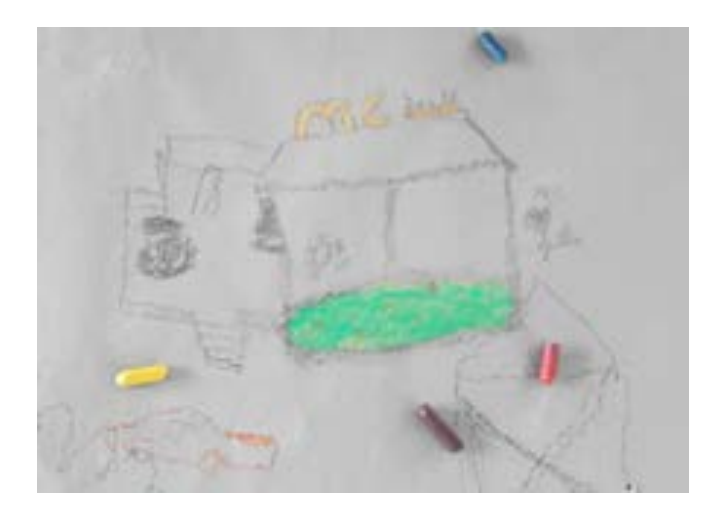
Fig. I- Drawing of the McDonald's restaurant in response to the question: What is the most important thing in your city? Workshop: "A Vila do Mañá, Vilagarcía de Arousa"

particular way in each city making them individual, unique and with the ability to value their homeland.